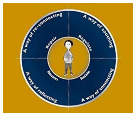
From Bomber (2020)